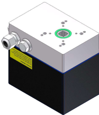
AN40 with inner square (Option)