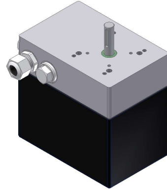
AN40 with feather key (Option)